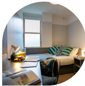
Single Room Shared Bathroom