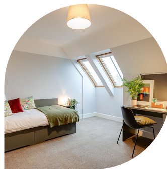
Single Room Ensuite