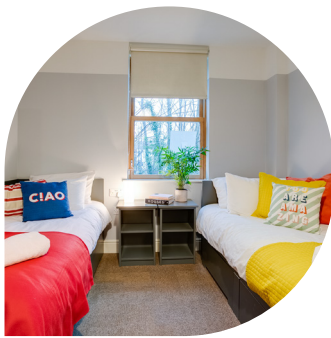
Share Twin Room

Griffith Halls of Residence (GHR) is the on-campus accommodation facility for Griffith College Dublin students. To book your on campus accommodation, please email live@ghr.ie