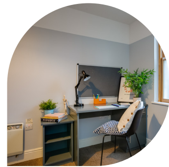
Single Room Private Bathroom