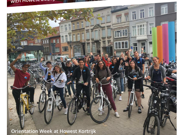
Orientation Week at Howest Kortrijk